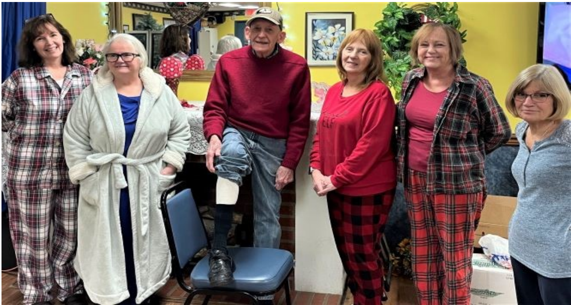
Staff and seniors joined in the fun and participated in Pajama Day on January 12, 2023.