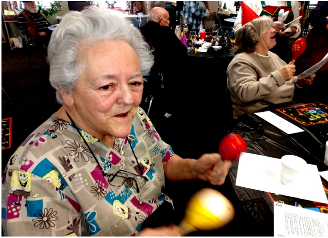
Dotty jamming with the maracas .