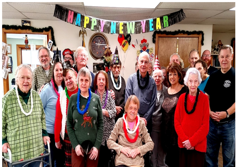
Happy New Year from the Hawley Center!